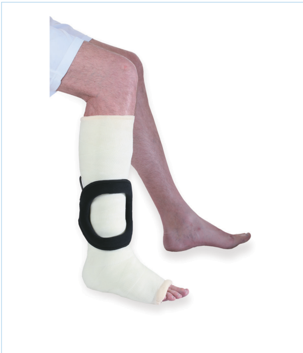
Tibia/Fibula (SFLX 2) Catalog # 1068226