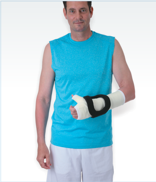
Radius/Ulna (SFLX 1) Catalog # 1068225