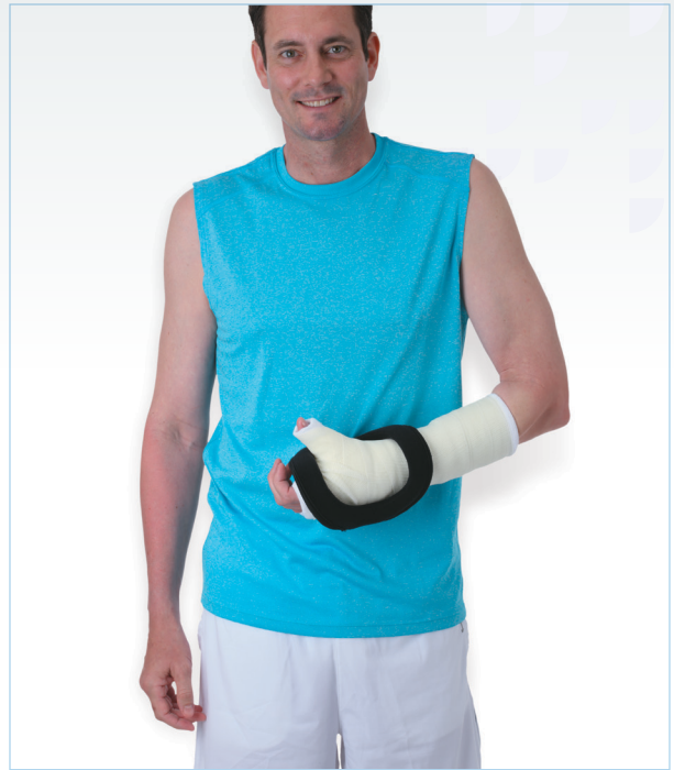
Radius/Ulna (SFLX 2) Catalog # 1068226