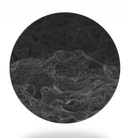
SEM image of TrellOss Surface at 50x magnification