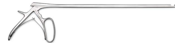
Kerrison Rongeur 6mm, 400mm 07.01223.001 4mm, 400mm 07.01223.002