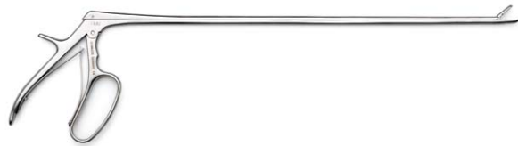
Pituitary Rongeur, IVD 6 x 400mm, Str 07.01222.001 4 x 400mm, Str 07.01222.002