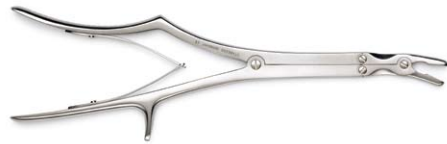
Syfert Rongeur, 8 x 16mm 360mm 07.01221.001